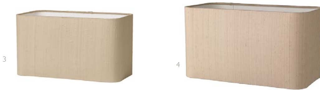
Square / Rounded Square